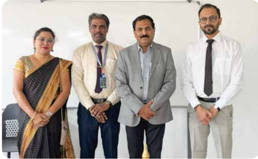
UTKARSH 2025 - In-House Management Fest - an event filled with intellect, creativity, and leadership challenges.