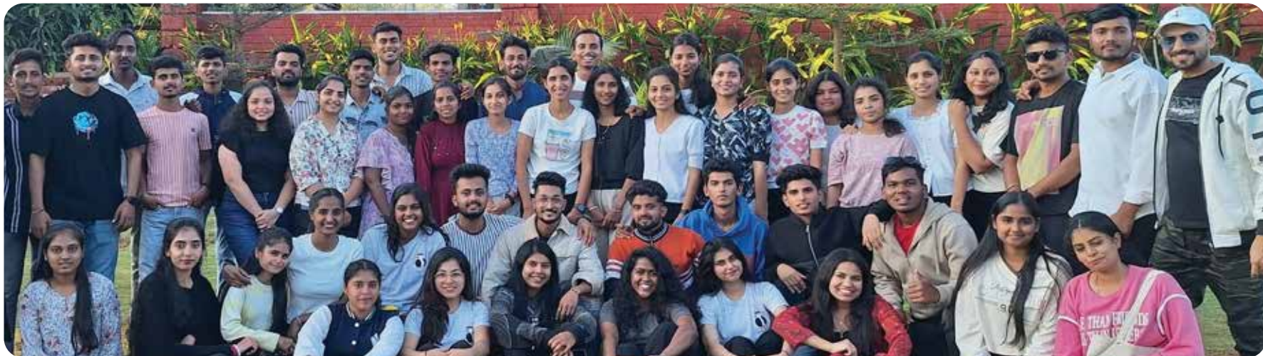
Outbound Training Program at the West Hill Resort, designed to foster teamwork, leadership, and interpersonal skills. From engaging activities to thought-provoking challenges, the day was filled with energy, learning, and fun!