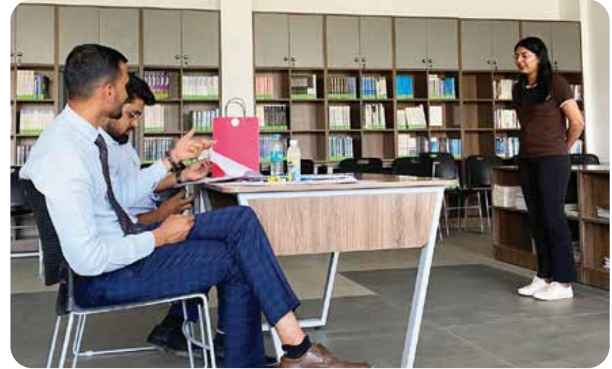
Stress Round – Best Manager